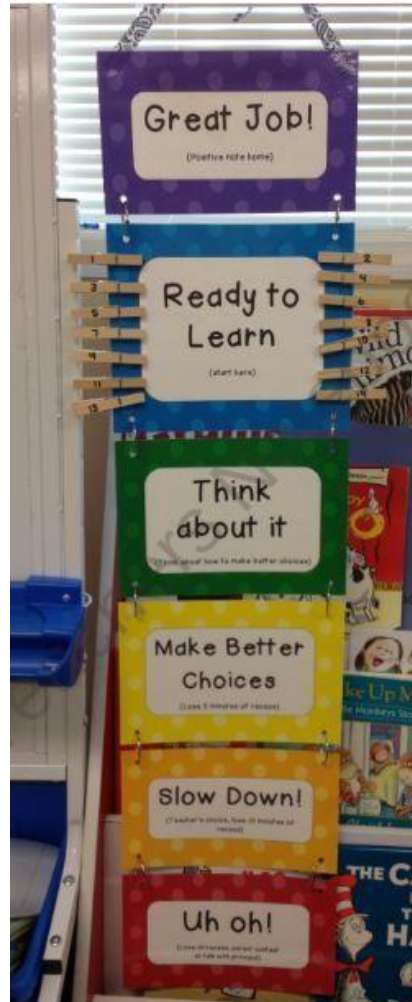
The Rainbow Ladder