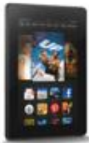
Kindle Fire HD